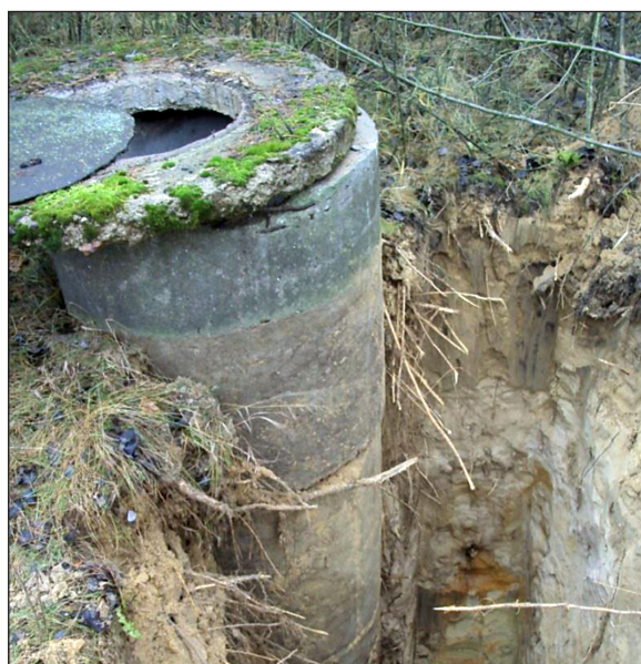
Figure 1. The photo of well's outcrop [Ignatowicz, 2011b]

The results achieved in stages I–II of the study allowed for designing the sorption barrier localized near the burial ground on a line of surface and underground waters outflow, which had to prevent from pesticide migration. The barrier design was described by Ignatowicz [2011b]. The applied study was carried out in 2009 and in 2012 in Folwarki Tylwickie village (Zabłudów commune, Podlasie province). The burial ground is localized in a direct vicinity of the cultivated field. That burial ground was classified into the 1 st category of threat.